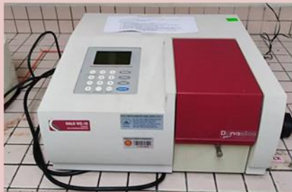
HALO VIS -10 Spectrophotometer