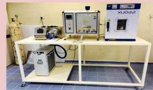
High Pressure Solvent Extraction Unit