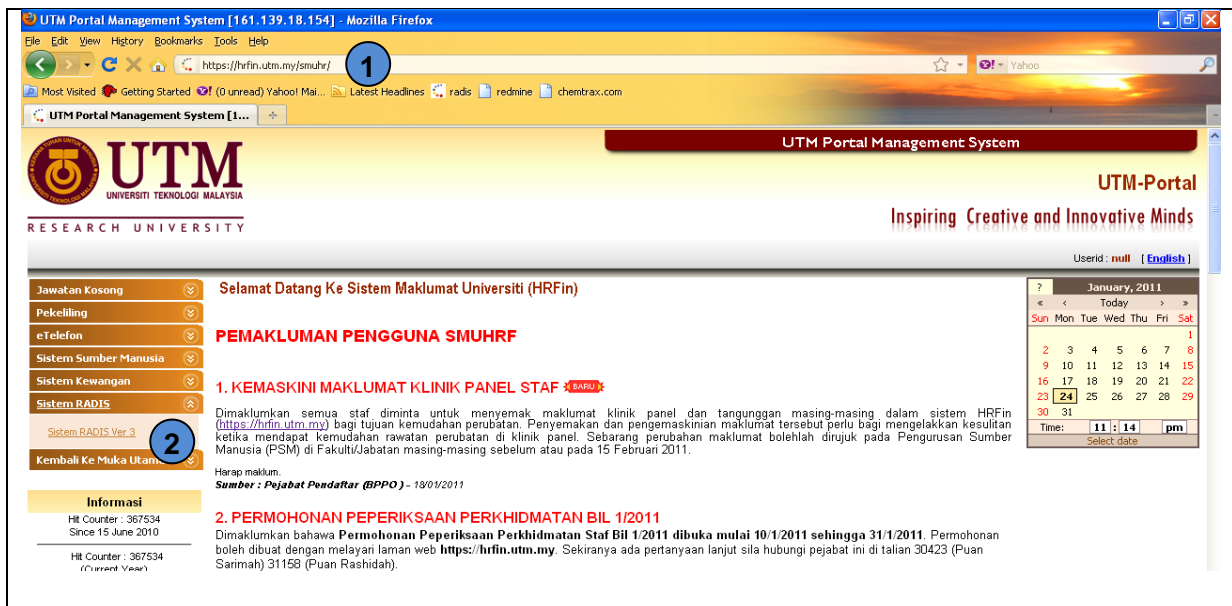
Figure 1: Website URL Screen