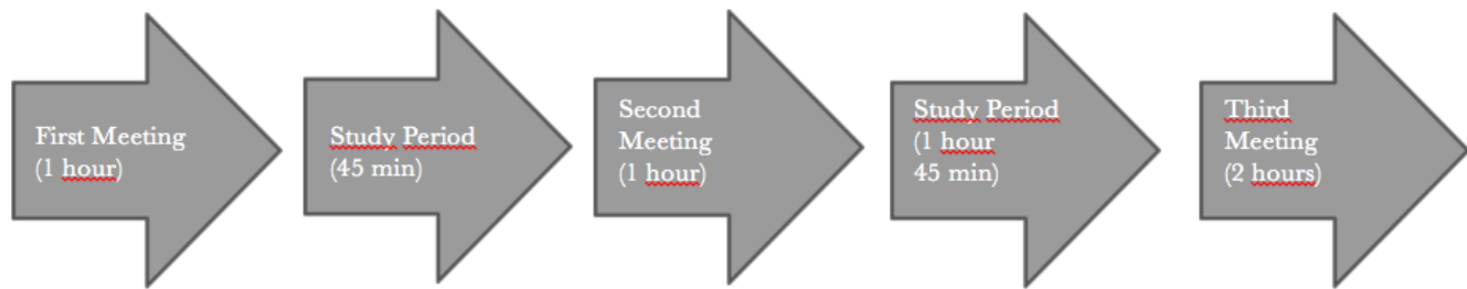
Figure 2. The Five Phases of the One-Day, One-Problem Approach to PBL

Each morning, the students confront a new problem – meaning that they handle five problems every week – in groups of 25, sub-divided into groups of five which are supervised by one or two tutors. The day consists in three group meetings and two study periods. Given the facilities available, the students are expected to stay on campus during the entire problem-cycle. The students receive a daily mark for their work, and their final evaluation for a given course is a combination of 15 daily marks and 3 understanding tests. Like their counter-parts from the “Hybrid” model of PBL for applied sciences, these students make use of hard scaffolds to tackle their problem scenarios. One of the founders of the polytechnic described the rationale as follows: “The philosophy that underpins the one-day, one-problem scheme is essentially a perspective of classroom happenings, in particular, the conditions that would enable the learners in a classroom to develop in a holistic sense, while acquiring the desired knowledge and technical skills along with the humanistic orientations expressed in the desired outcomes” (Alwis, 2012, p.43).