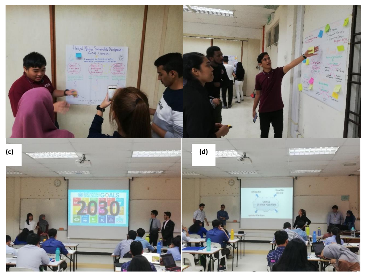
Figure 1. Class activities in the ITE course: (A& B) Group Peer Teaching, (C & D) Class Presentation