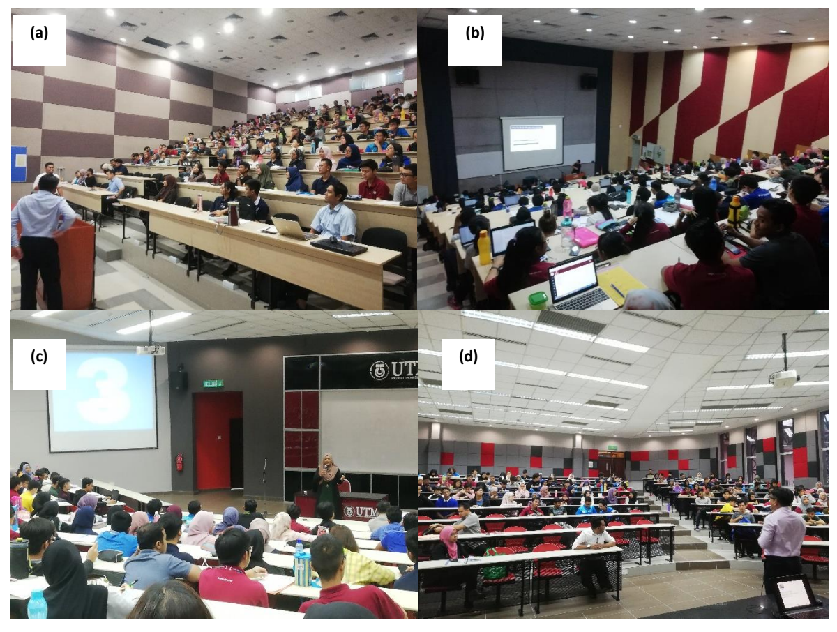
Figure 3. Activities in the ISP course that supports CPBL: (A) Engineering Overview Sharing (B) How To Use Google Search Workshop (C) Effective PowerPoint and Communication Presentation (D) Situation of Water in Iskandar Puteri Sharing by MBIP Representative

In Week 7 and 9, ISP course organized talks entitled Effective Communication and Presentation which is another perfect example of the integration of ITE and ISP, which is a topic that the students need to rapidly improve. This is in line with ITE Course CLO4 which stresses on the ability to communicate with confidence in oral, written and presentation. Students commended and appreciated the two seminar sessions related to Effective Communication themes conducted. The students have significantly improved their slide presentation visual and oral presentation skills after attending the successfully and effectively executed talks. These rapid positive changes were witnessed by all ITE course lecturers. It can be deduced that most of the students regarded these two seminar sessions (effective communication theme) as the best and the most impactful one which highly improved their communication and presentation skills.