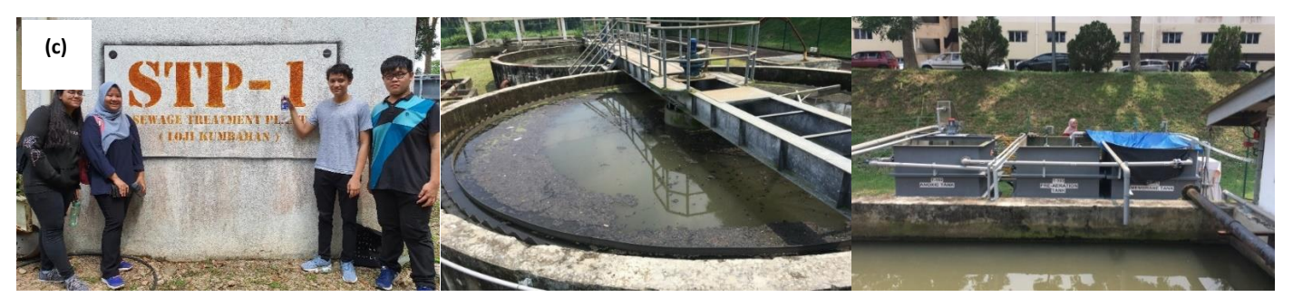
Figure 4. Student Site Visit to the Sewage Water Treatment Facility (a) Visit Sewage Treatment Plant 1 (STP 1); (b) Clarifiers; (c) From left (Anoxic tank, Pre-Aeration tank and Membrane tank)

It is worthy to note that besides improvement observed by the lecturers in class, from reports and student presentation, the reflection journal appears as a proof that students acknowledged the scaffolding support and integration of the arrangement of talks in ISP course that greatly complement their comprehension on the problems given in the CPBL mode in ITE course. By writing reflection, students are taught to acknowledge their thinking and learning process that they have experienced based on Gibb's reflective cycle (Gibbs, 1988). Making a good reflection is very important to enhance students' learning through the learning experiences that they have went through.